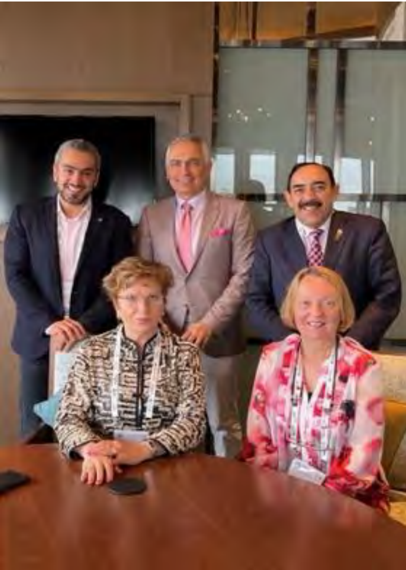
ISD Executive Committee Meeting at the World Congress of Dermatology in Singapore.