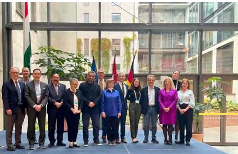
Joint meeting of the IJD section editors and the Executive Committee at the Hungarian Embassy in Berlin.