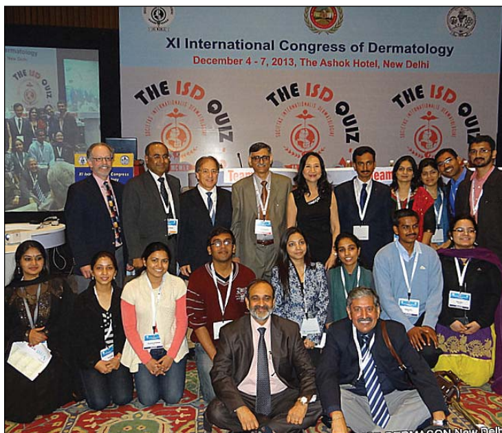
ISD Quiz winners, ISD Executive Committee members and Congress organizers celebrate the success of “THE ISD QUIZ.”