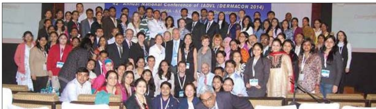
ISD XI ICD scholarship recipients with members of the ISD Executive Committee