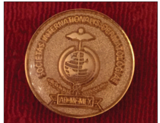
ISD long-term membership recognition pin