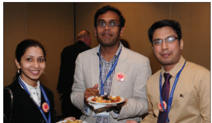
ISD members enjoy camaraderie at the evening's festivities.