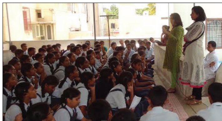
Skin hygiene education