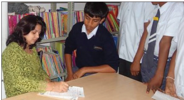
School screening camp

To evaluate the success of this program, we are conducting a pre-test and post-test based on the module content. Also, at the end of the course, we are planning an assessment. Only those who achieve the minimum marks would be given the credit points.