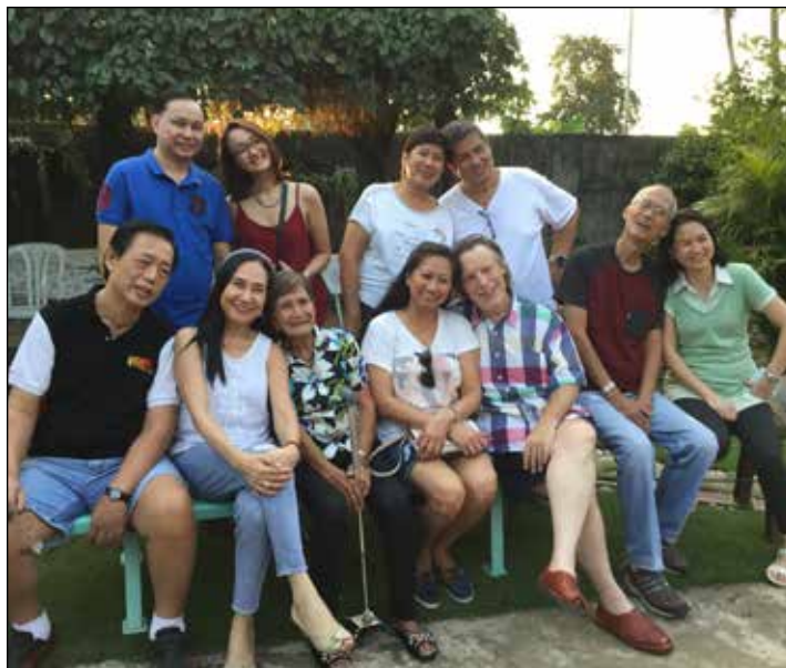
With her greatest support team: FAMILY!

What comes next? I hope to be involved with the ILDS more, with the World Skin Health Day project being a brainchild of ISD since three years ago. I will still be collecting bells as I travel, and will probably still be dancing the rumba and the tango to keep fit and graceful.