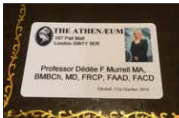
The Athenaeum membership card