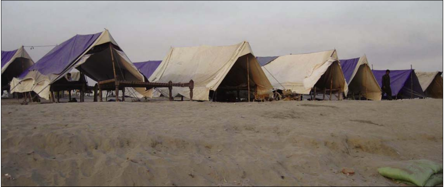
Tented camp area for flood refugees near the city of Multan, Pakistan.

The biggest natural disaster in the history of Pakistan struck in the month of July this year. Heavy monsoons caused large scale flooding which continued for two months, devastating a large part of the country and displacing millions of people. The extent of damage to the already compromised and poor physical infrastructure in the rural areas was huge. The roaring flood waters washed away almost thousands of houses, schools, hospitals, roads, and bridges. At one point, about a fifth of the country was immersed under water. People in the affected areas were isolated and stranded with no access to shelter, clean drinking water, food, and medicines.