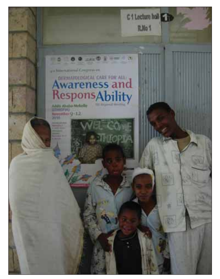
Patients waiting for a medical visit at Ayder Hospital.