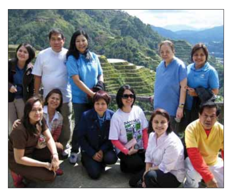
Banaue Mission Group 2010 PDS Dermatologists; at the background is the famous Banaue Rice Terraces.

Part of the PDS Mission is to bring dermatological services to indigent citizens, in the poorest of the communities to the farflung indigenous areas of the country. Dermatological outreach missions are conducted year-round, led by its driven members, with special focal points set each year every January for its Banaue Medical Mission and every November for its Skinweek Program.