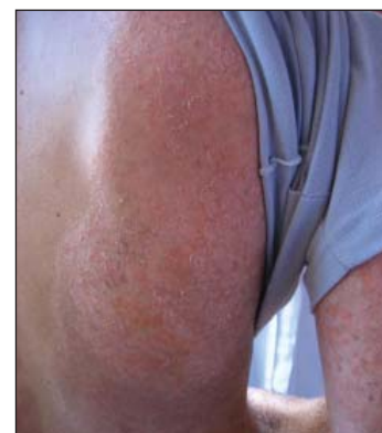
A patient with Tinea Imbricata at Elsie Gaches Village.