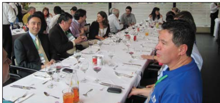
Meeting attendees enjoy lunch and camaraderie with fellow ISD members and speakers.