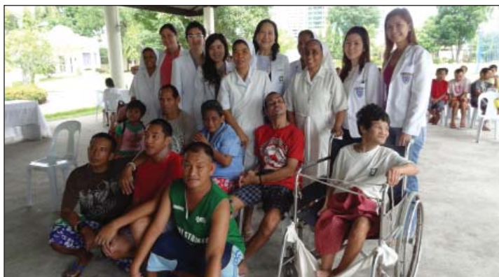
Volunteers and the people they care for at Elsie Gaches Village.

Elsie Gaches Village (EGV) is the only government center for mentally challenged persons in the Philippines. Built on a 16 hectare site donated by philanthropists Samuel and Elsie McClosky Gaches, the center was formally inaugurated in 1964 under the supervision of the social welfare administration (now the department of social welfare and development). Today, EGV has expanded to include 14 cottages for the care of mentally challenged persons – 700 of which are children, mostly orphans, mentally challenged and sick.