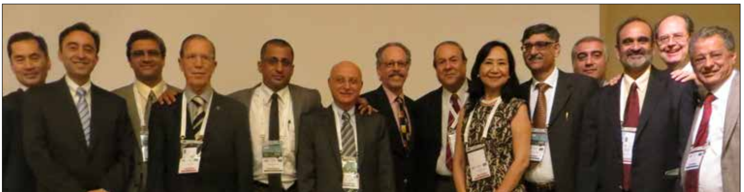
The faculty of the program with several distinguished session attendees.

The program was well attended and concluded with a renewed understanding of the regional work being done by several ISD members and the historic influence of the silk route.