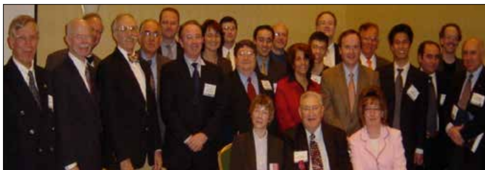
An IJD Editorial Board meeting in 2003.

Yes, for sure. It has exceeded all of my expectations in that I have been part of so many people's professional lives. It is so interesting to think about where the manuscript originated, what it must be like working in that area, what it takes to put together a study and to formulate a