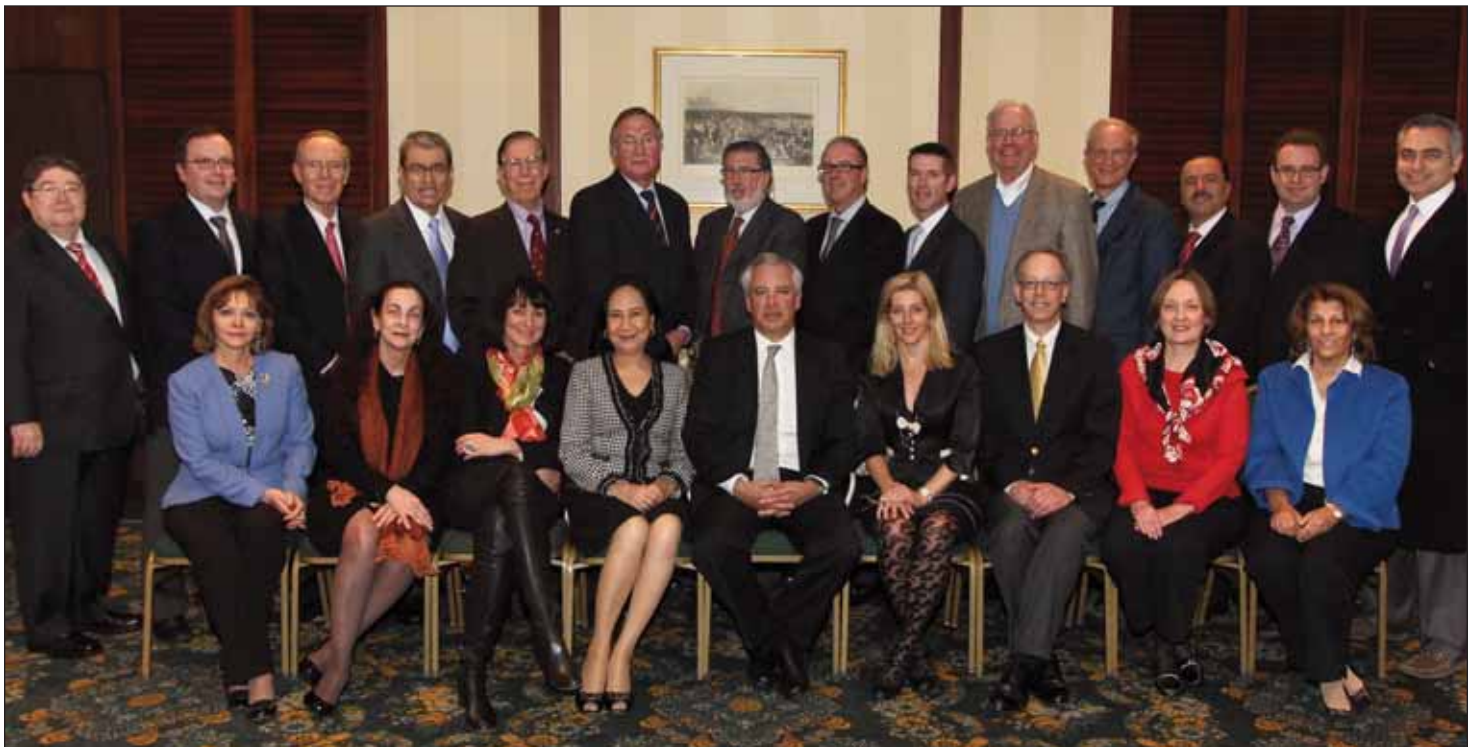
Group photo from the ISD Board meeting