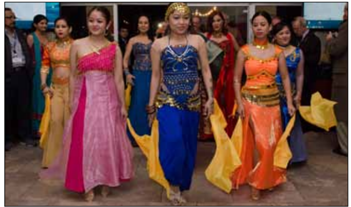
Dermatology residents and consultants from the Philippines perform a traditional Indian dance.

Next year's AAD Annual Meeting will be in Denver, Colorado, in March 2014, so plan to attend the next annual ISD reception. It's sure to be another not-to-be-missed gathering of ISD friends from all corners of the world!