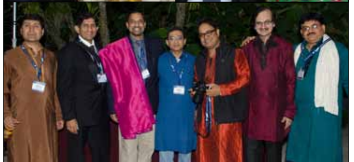
ISD members were all smiles spending time with their colleagues.