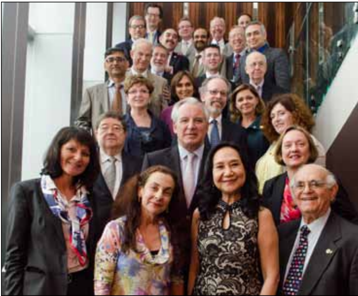
ISD Board of Directors.