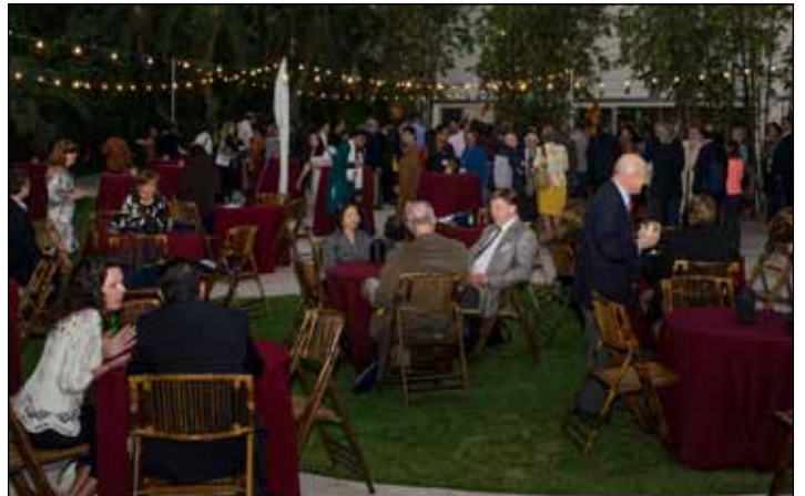
Guests enjoy the festive and lush atmosphere of the Miami Beach Botanic Gardens.