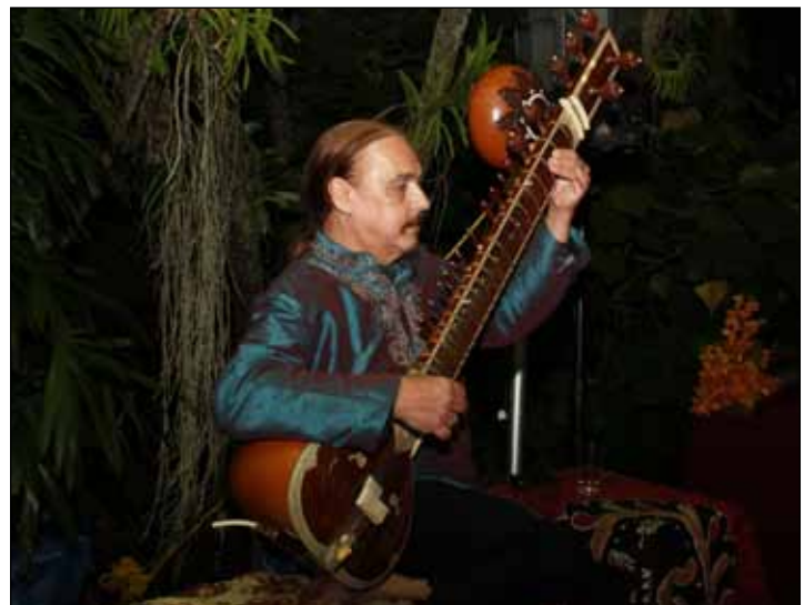
A sitarist entertains guests to the sounds of Indian music.