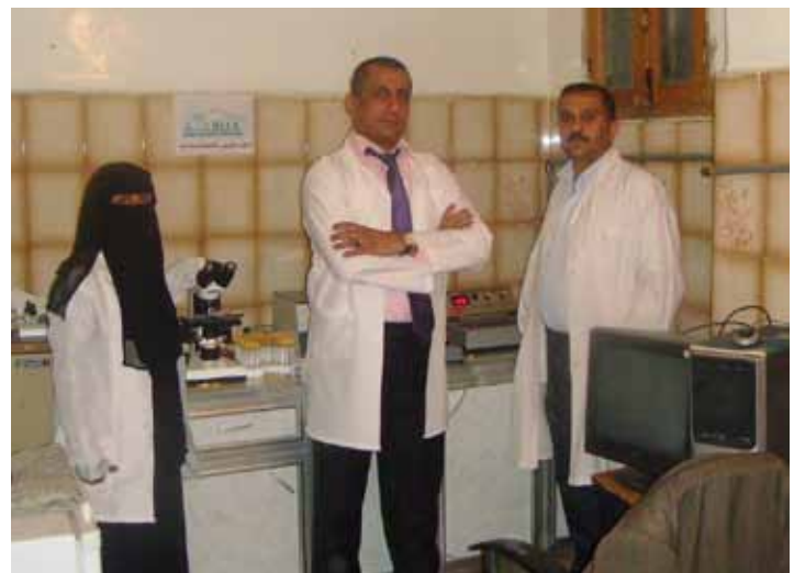
Dedicated volunteer staff of the RLCC.