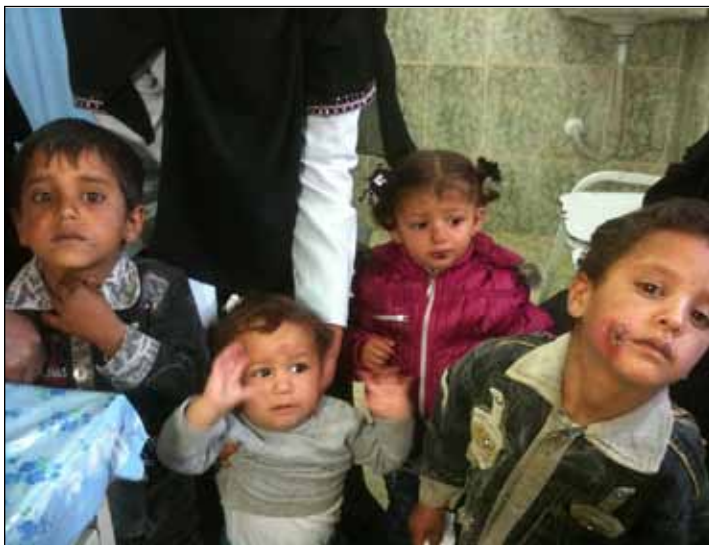
Local children with leishmaniasis seen at the RLCC.