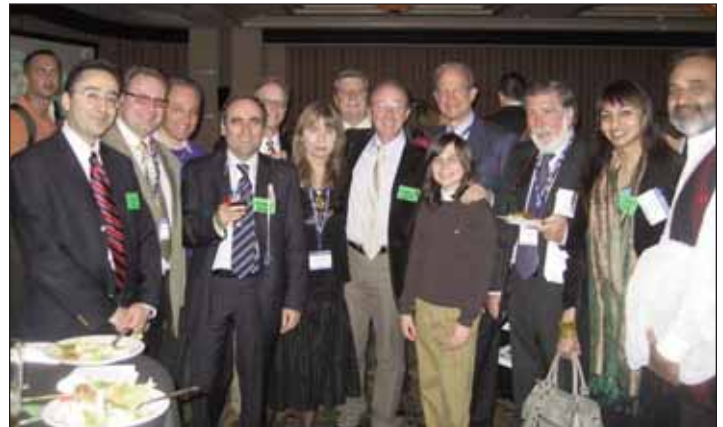
Good fun and good cheer enjoyed by all.