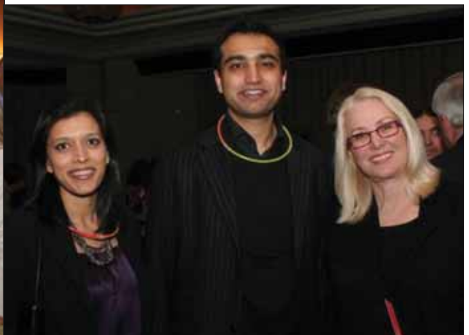
Revelers enjoy the festive atmosphere of the ISD reception.