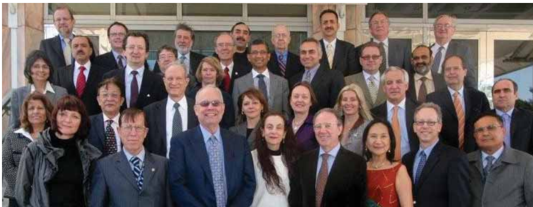
The ISD Board of Directors gathered for a meeting on March 5, 2010, at the AAD meeting in Miami Beach.