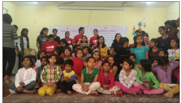
Skin camp for adolescent orphan girls in New Delhi, India, held by the Indian WDS