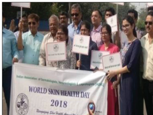
Skin health rally