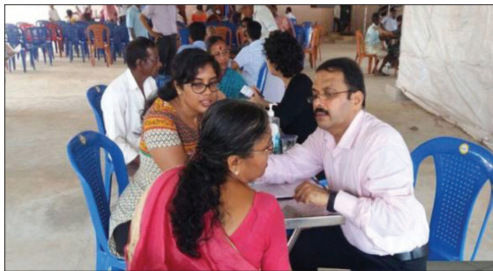
Free skin health camp