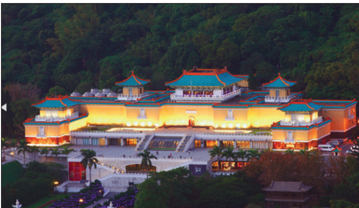
National Palace Museum has one of the world's largest permanent collections of ancient Chinese imperial artworks and artifacts, including the famous Jadeite Cabbage.