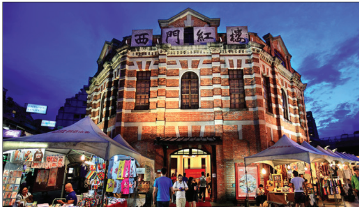
Ximending Shopping District provides a diverse variety of clothing stores, bars, and restaurants.

For more information and updates, visit the meeting website at https://www.tdmt.org/2018/en/?AgendaSID=11 .