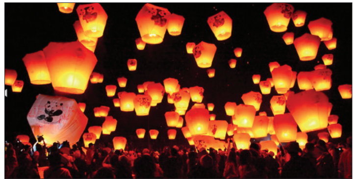
Pingxi offers visitors the opportunity to create a traditional Chinese Lantern. There are also hiking trails and the famous Shifen Waterfall nearby.