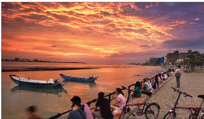
Tamsui old street is located on Tamsui River's riverfront and has a boardwalk filled with small eateries and shops. Also nearby are historical sites such as Fort San Domingo.