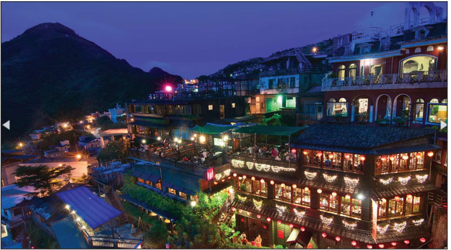
Jiufen was once a small gold mining town that overlooks the sea. Its maze of cobblestone alleyways provide visitors a glance into its past with its many tea rooms, cafes, food stalls, and souvenir shops.