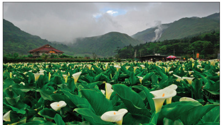
Yangmingshan National Park features numerous hiking trails and natural beauty. The area is rich in sulfur, and visitors can enter decommissioned sulfur mines.