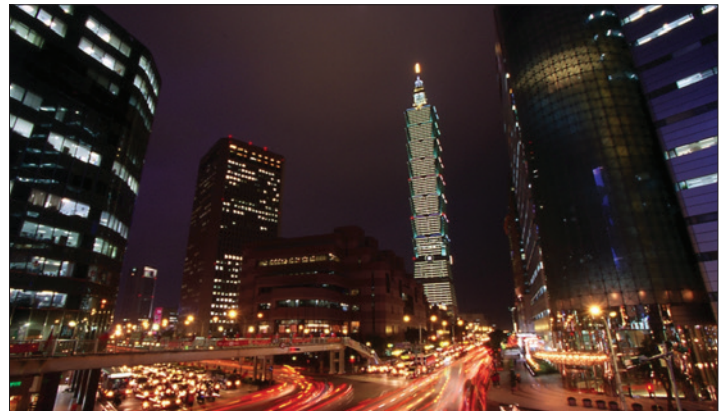
The downtown Xinyi District not only offers world-class shopping, but also a chance to visit Taiwan's tallest skyscraper - Taipei 101.