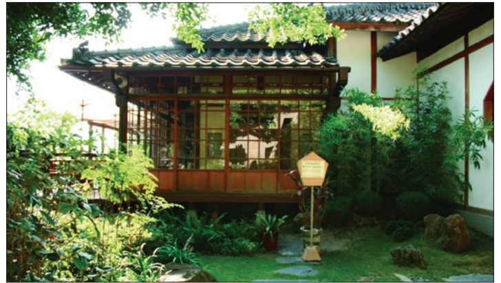
Beitou Museum was initially a hot springs hotel and later restored as an historical building. The museum has both permanent and themed exhibits.