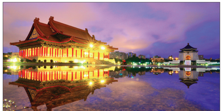
Chiang Kai-Shek Memorial Hall is located in downtown Taipei and offers traditional gardens, a ceremonial arch, and exhibition halls. The National Theater and Concert Hall are nearby and offer regular musical and dance programs.