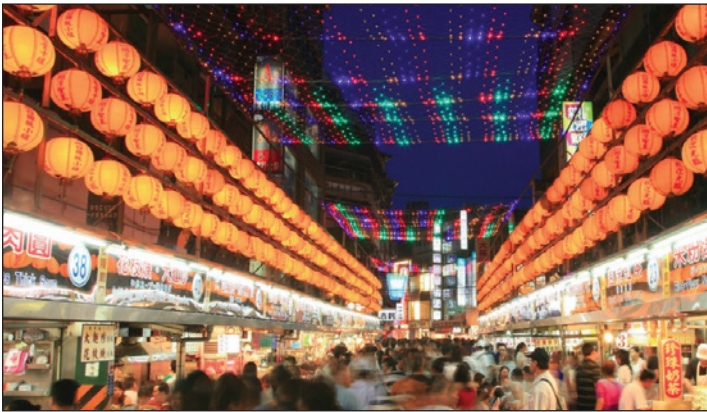
Keelung Miakou Night Market offers a taste of Taiwan's traditional cheap and delicious night market food.