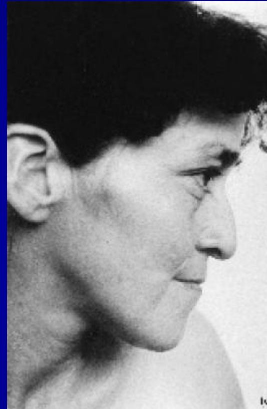
Figure 5 Evolution of a patient with actinic prurigo during treatment with cyclosporin A (CsA): (a) before initiation of treatment with CsA; (b) after 2 months of treatment with CsA; (c) 2 months after completion of treatment